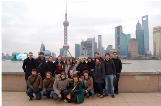
ESSCA Students in front of the Bund

In September 2006, ESSCA opened a centre in the heart of the 21st century new business capital, Shanghai, China. The location of Shanghai, as the 'dragonhead' of China's economic development gives ESSCA students the opportunity to comprehend the dynamics and complexity behind the world's second largest economy.