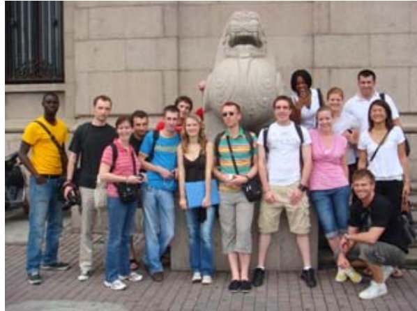
Group of Summer Programme students in Shanghai

ESSCA and its partner ESAI, offer personalised and attentive support for students in Shanghai. The trilingual (Chinese, English and French) staff members assist students in from finding accommodation to booking a domestic train ticket. All classrooms are air- conditioned and equipped with advanced presentation and lecturing tools. There are also computing facilities and a faculty room onsite and wireless internet access are available in every classroom. Students will also find all compulsory reading materials and other reference publications which are needed for their study modules in the ESSCA library at ESAI. Further students, students will benefit from the extensive collection of Alliance Française and French Chamber of Commerce.