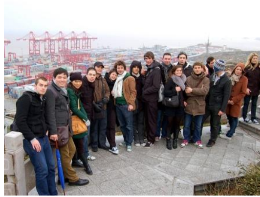
Visit of Shanghai harbour

In March 2009, ESSCA organised a study trip to Chinese companies and Yiwu Market in Zhejiang Province, which gave first-hand knowledge to the students on the impact of the financial crisis on the Chinese economy. This trip has received generous sponsorship from local companies such as Zhejiang Ai Le Group, Zhao Tong Real Estate Company, and SinoFrance.org.