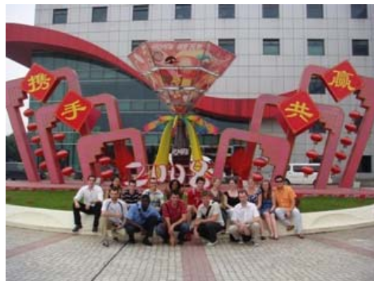
Visit to Coca Cola factory

Throughout the years, ESSCA students have successfully managed to transfer their academic