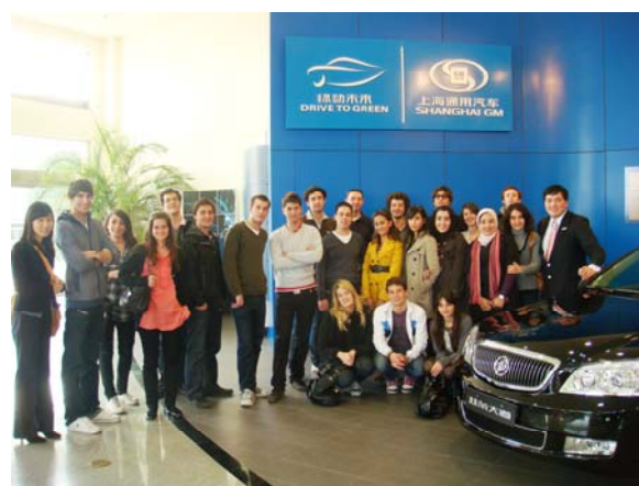
Visit to Shanghai G.M.

knowledge to the real-life business practices during their employment in various sectors in China. Some of the current and past employers include: