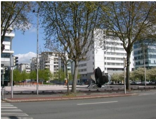
← Residence de la Maine, 18 allée Fr.Mitterrand, 49100, Angers Car access rue de Rennes →